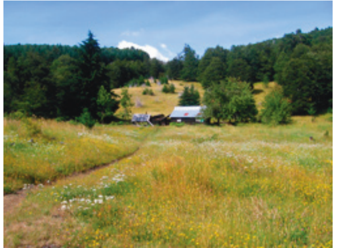
Alpine Looking Meadows