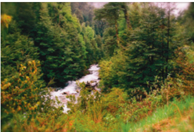
Hua Hum River