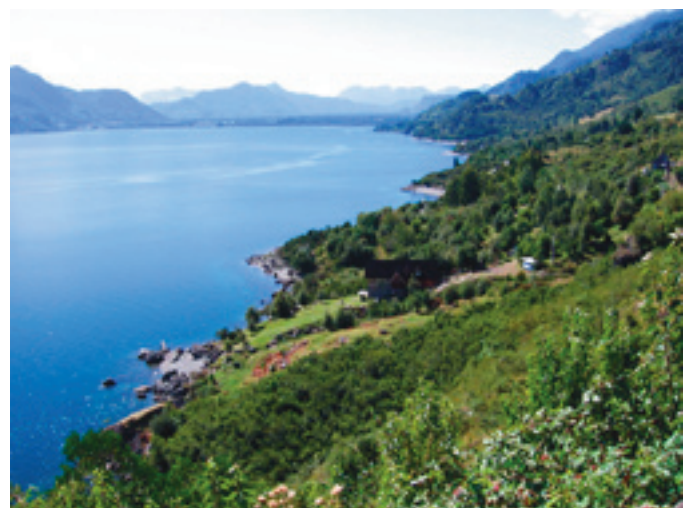
Nearby Lake Ranco