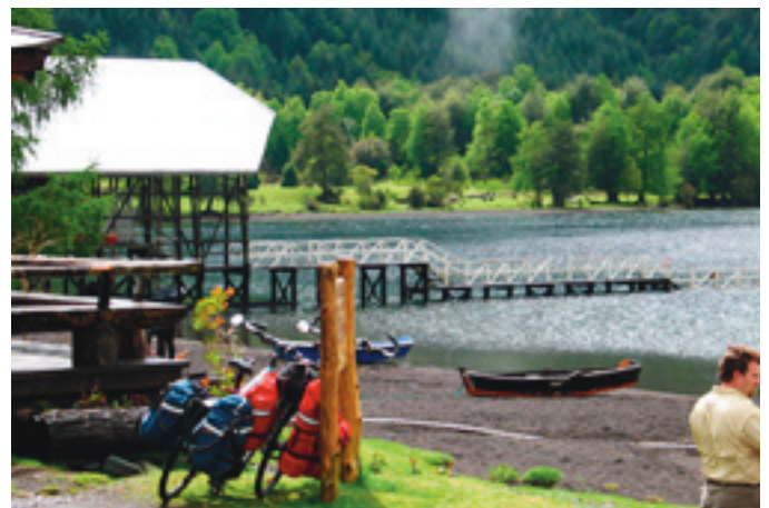
Puerto Fuy - Ferry Crossing