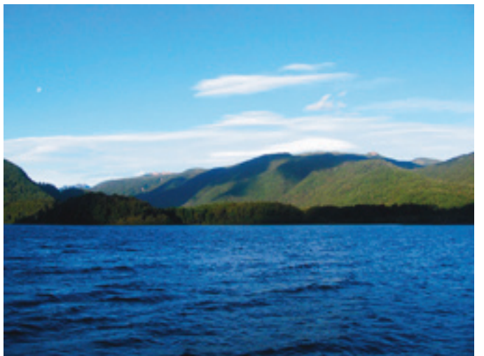
Lake Pirihueico - Facing Property Shore